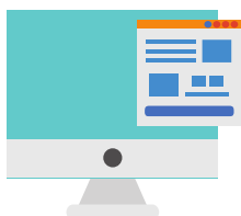
Virtual prevention education